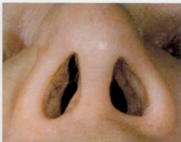
Figure 3. Postoperative photo shows that the procedure has significantly opened the nasal vestibule.

LLC orientation converts an airway-obstructing concavity into an airway-supporting convexity.