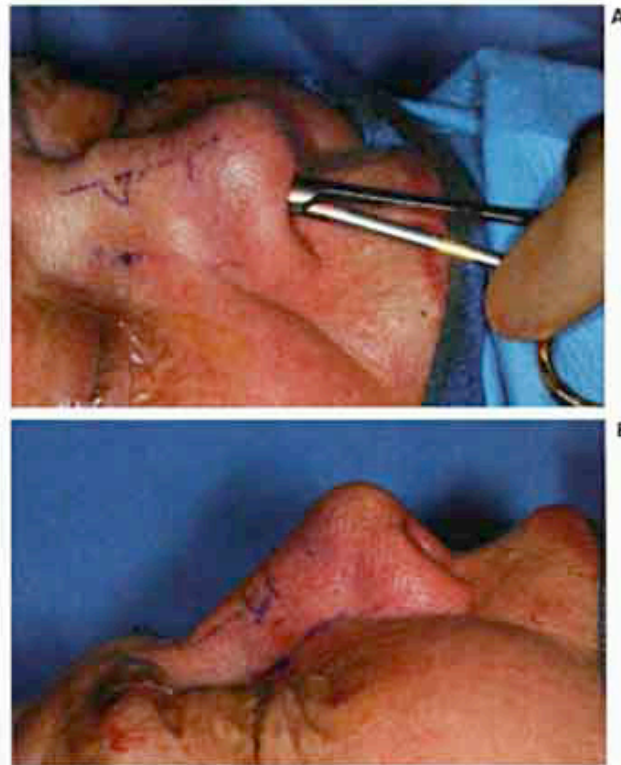
Figure 3. The composite graft is placed endonasally (A) and suture-fixed with transcutaneous 6-0 polypropylene sutures (B).

(figure 1). Upon evaluation, she was found to be a candidate for this technique. Harvested conchal bowl cartilage was cut into shape to fill in the deformity (figure 2). The ENDURAGen implant was sewn to this construct to act as a carrier and to provide smoother dorsal contour. The composite graft was placed endonasally (figure 3, A) and was suture-fixed with transcutaneous 6-0 polypropylene sutures (figure 3, B). Twelve months postoperatively, the cosmetic outcome was satisfactory (figure 4). If anything, the profile view revealed a bit of overcorrection, which is testament to the long-term effectiveness of this technique.